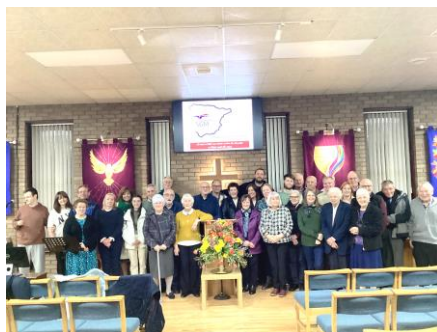
Trinity Church, Rainhill

Please pray for the new contacts in Viso del Marqués, a village near Santa Cruz. A Bible study group has been started, and at least one person has professed faith in the Lord Jesus.