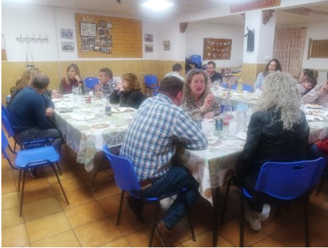
Married couples' dinner

We particularly thank God for two activities that are being a real blessing: the ladies' meeting and the married couples' workshop. We thank Him that these can continue in the future. We have seen fellowship with one another grow, and we have witnessed to several people who are not believers. We pray that the Lord would continue to give fruit in our lives through these activities.