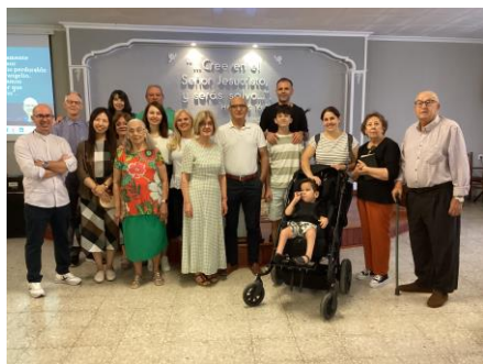
The group visiting Moral church