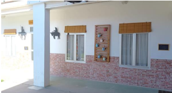
Alterations to the outside wall of the Library

We don't want to go without wishing you a happy Christmas! We hope you will spend a peaceful and restful time with your family, remembering that our Lord came into this world. We pray that the Lord will help and guard you through this special time. Thank you for praying for us. God willing, next year we shall go on being amazed because of His power and we shall be able to continue praising Him for His goodness.