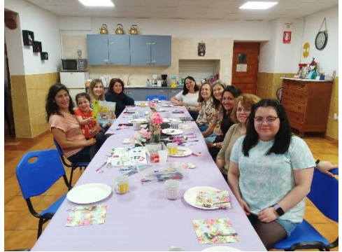
Young women's afternoon tea