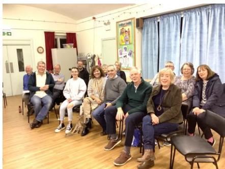
Bromborough Evangelical Church

After this we made a few deputation visits together at Trinity Evangelical Church (Rainhill), Bromborough Evangelical Church, Belvidere Road Baptist Church (Liverpool), Kingston Evangelical Church (Hull) and Artillery Street Evangelical Church (Colchester). Finally, the family visited friends in Wimbledon and had a tour of London before returning to Spain.