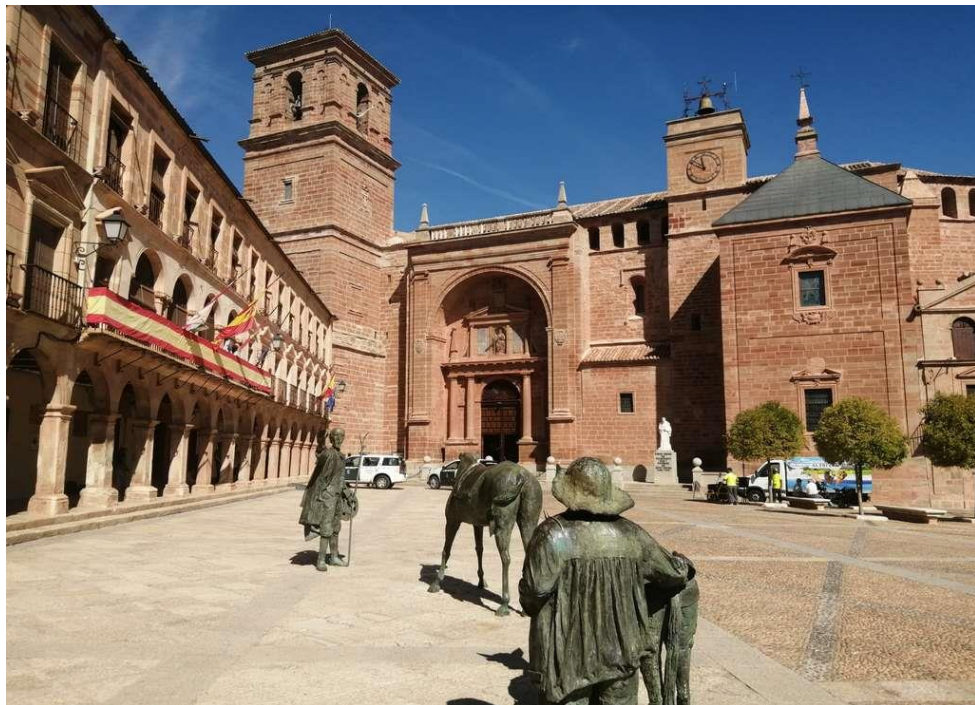
Villanueva de los Infantes

A work of faith and labour of love for the glory of Christ until He comes