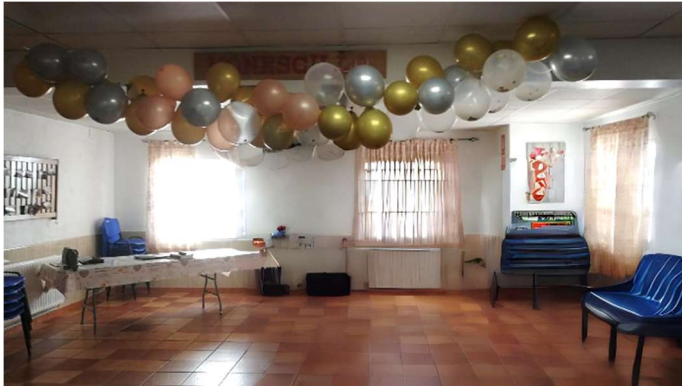
As the room would be without the column (Photoshop)

Some time ago, we thought about removing the column from the middle of the dining room. Sometimes it prevents us from carrying out very simple activities in this room. That's why we decided that work should be done to remove the column. The idea is to put two girders in the ceiling to support the upper floor, thus freeing up all the downstairs area. Therefore, let's pray that the Lord would help us to fund this project (very costly, of course) and protect us from accidents throughout the process.