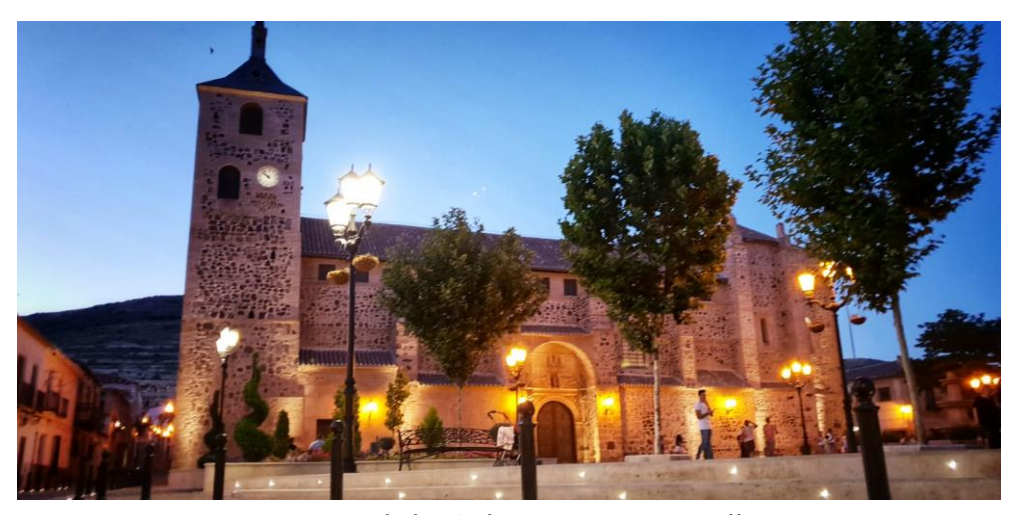
Moral de Calatrava Town Hall

Prayer is the Christian's vital breath, The Christian's native air, His watchword at the gates of death; He enters heaven with prayer.