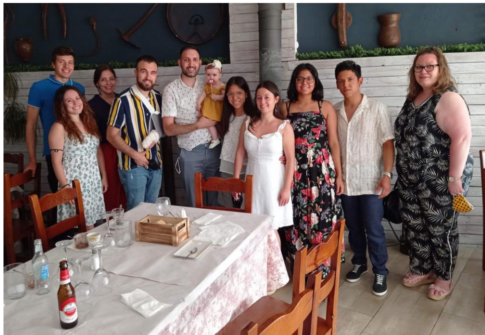
Young people's group