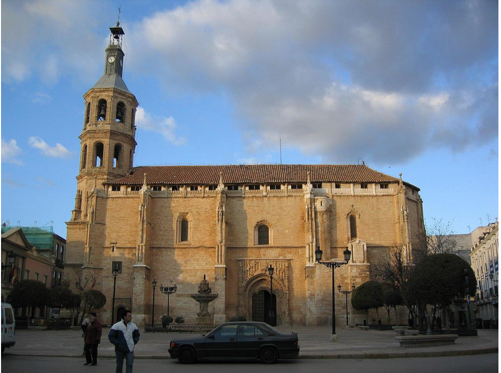
Church of the Assumption, Valdepeñas

A work of faith and labour of love for the glory of Christ until He comes