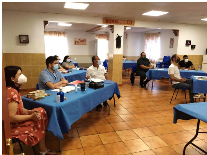
SEFOVAN in Monescillo