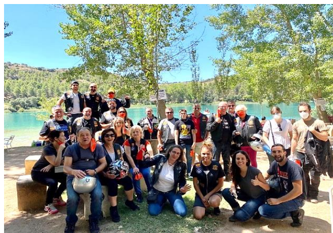
Christian Motorcyclists Association retreat

In July, once the worst of the pandemic seemed over, a retreat of a group of Christian bikers took place. The Christian Motorcyclists Association is committed to street evangelism and creating friendships with other bikers in various places.