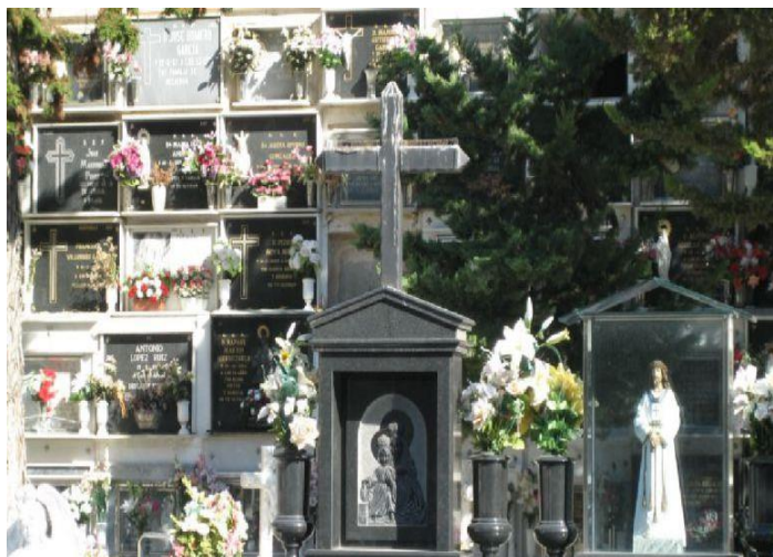
Spanish cemetery on All Saints' Day

Most people visit the graves of relatives and decorate them with elaborate floral displays. For many people it's an emotional time, and Mass will often be performed in the cemetery several times throughout the day. Travelling is difficult on October 31st, as millions of people finish work early in the afternoon and head for their birthplace – so there is a lot of traffic congestion, especially on the motorways leaving the main cities.