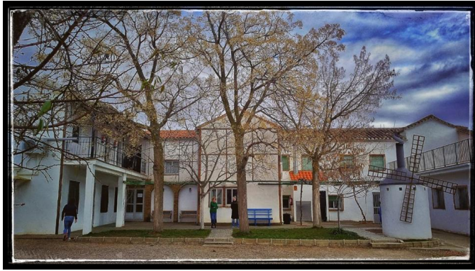
Monescillo Christian Centre

Thank you for your prayers and may the Lord bless your lives.